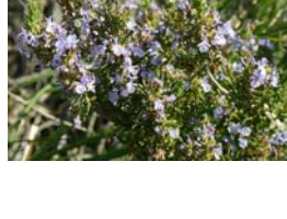
Rosemary ( Rosmarinus officinalis ) throughout garden