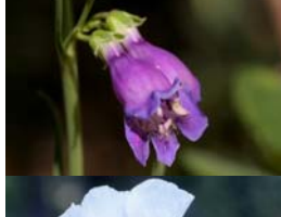
New Mexico Beardtongue ( Penstemon neomexicanus )