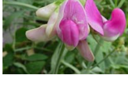
Sweet Pea ( Lathyrus odoratus ) Heritage Farm house