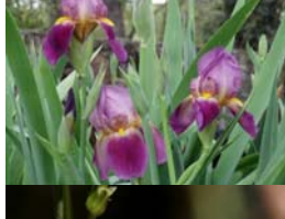
Iris ( Iris cultivars) in Fantasy Garden, Heritage Farm, Camino de Colours