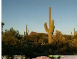
Saguaro ( Carnegiea gigantea ) Desert Conservatory