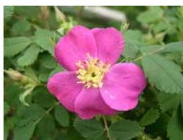
Roses ( Rosa sp. ) in Jardin Redondo, Ceremonial Garden, at Pond, Heritage Farm, and throughout Garden