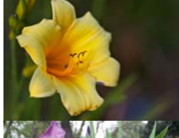
Lilies: Daylily ( Hemerocallis cultivars) Heritage Farm, Camino de Colores Water Lily ( Nymphaea sp. ) pond