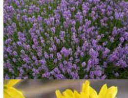
English Lavender ( Lavandula angustifolia ) throughout Garden