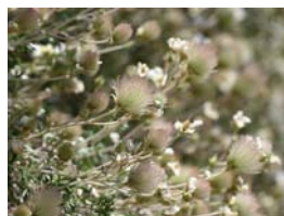
Apache Plume ( Fallugia paradoxa ) in Desert Garden