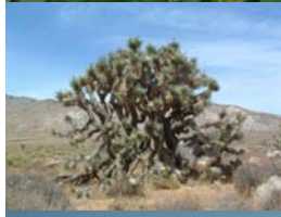
Joshua Tree ( Yucca brevifolia ) in Desert Garden