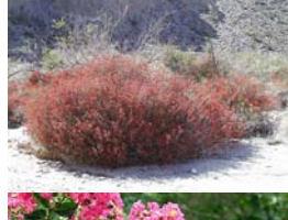
Chuparosa ( Justicia californica ) Desert Conservatory