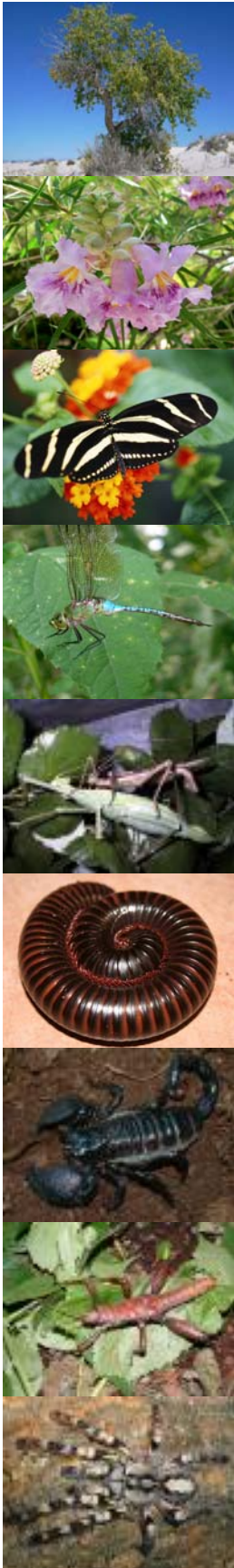
Rio Grande Cottonwood ( Populus wislizeni ) throughout Garden