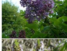
Lilac ( Syringa vulgaris ) throughout Garden