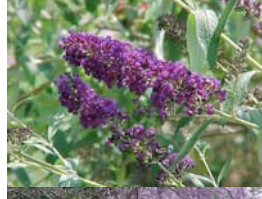
Butterfly Bush ( Buddleja davidii ) throughout Garden