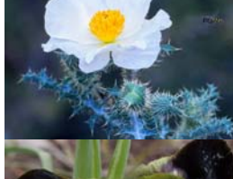
Sacramento Prickly Poppy ( Argemone pleiacantha ssp. Pinnatisecta )