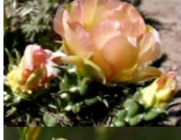
Santa Fe Cholla ( Cylindropuntia viridiflora ) Roundabout & Heritage Farm