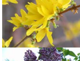
Forsythia ( Forsythia sp. ) throughout Garden