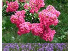
Crape Myrtle ( Lagerstroemia indica ) Arbor Perennial Garden