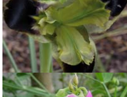
Snake's Head Iris ( Hermodactylus tuberosa ) in Woodland Transition Garden