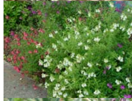
Autumn Sage ( Salvia greggii ) throughout Garden