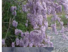
Chinese Wisteria ( Wisteria sinensis ) Ceremonial Garden